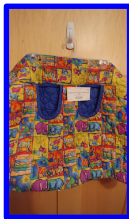
Shopping Cart Covers