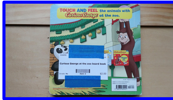
Tag goes on back of book