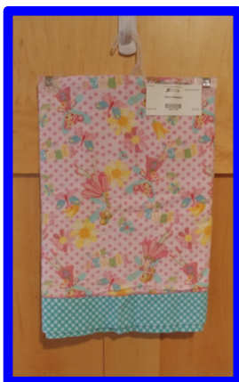
Blankets-ALL Bedding should be hung-sheets, blankets, sleeping bags, crib skirts, bumpers, curtains, etc