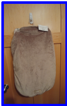
Car Seat Covers (heavy ones are winter sale only)