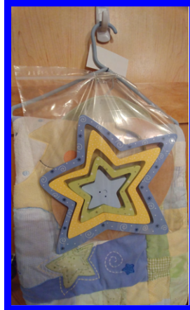
Bedding Sets (hang all pieces together)