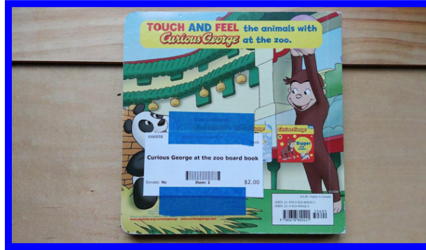
Tag goes on back of book