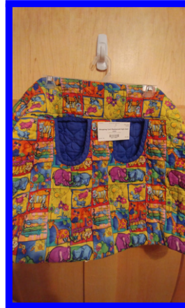
Shopping Cart Covers