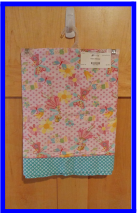
Blankets-ALL Bedding should be hung-sheets, blankets, sleeping bags, crib skirts, bumpers, curtains, etc