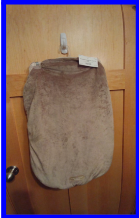
Car Seat Covers (heavy ones are winter sale only)